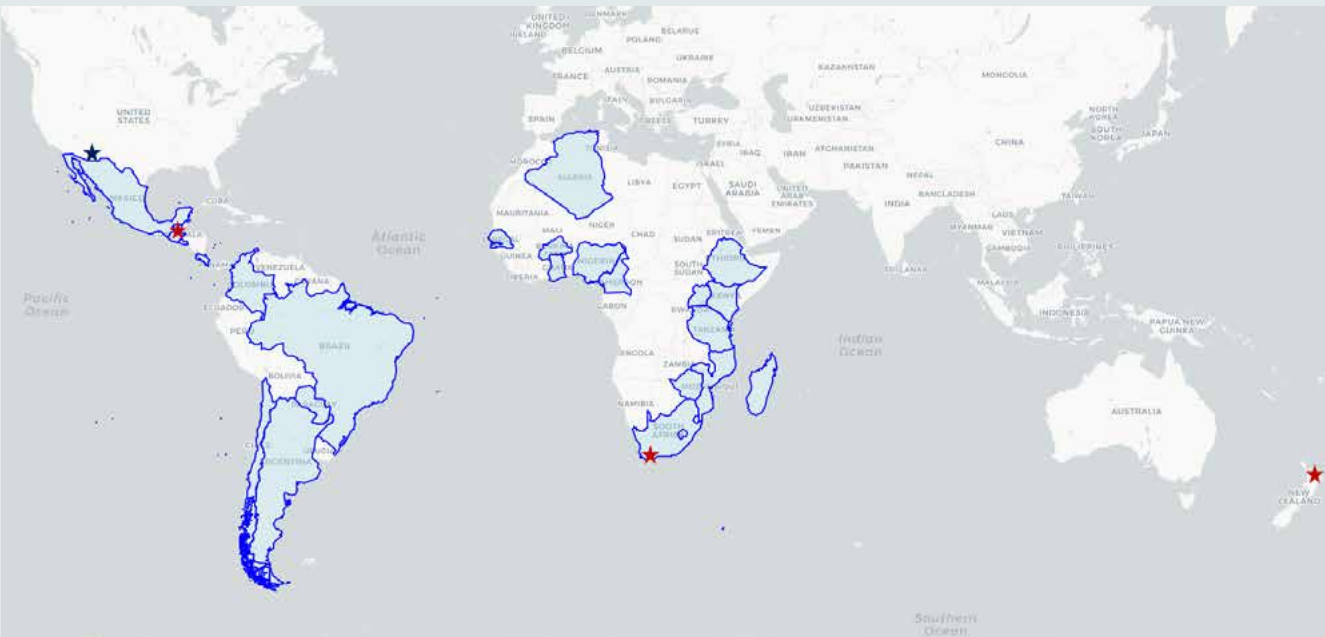
Countries in which the CARP is hosting research projects (2023–present)

CARP initiated its activities in Africa as a two-year program (2022–2024), and in 2023 was expanded to the LAC and Pacific Islands regions for an additional five years. The University of Arizona implements CARP in partnership with Stellenbosch University (Africa), the Consejo Superior Universitario Centroamericano (CSUCA, LAC), and Auckland University of Technology (AUT, Pacific).