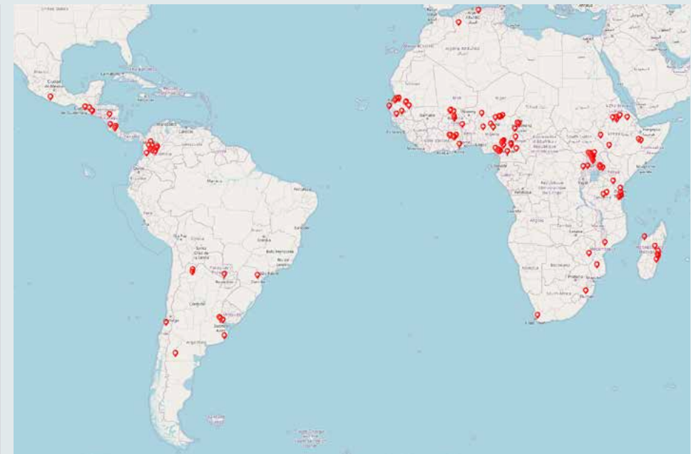
Locations of CARP scholars' research project field sites (2023–present)